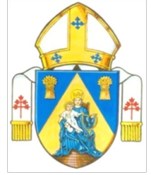
Archdiocese of Regina Coat of Arms