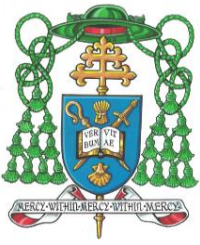
Archbishop of Regina Coat of Arms