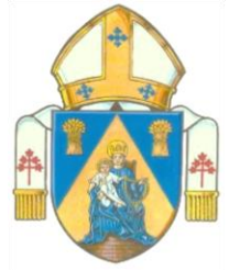
Archdiocese of Regina Coat of Arms

Holy Rosary Cathedral respectfully acknowledges that we are situated on Treaty 4 territory, traditional lands of First Nations and Métis people.