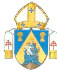
Archdiocese of Regina Coat of Arms

Holy Rosary Cathedral is located on Treaty 4 Territory, the traditional lands of the Nêhiyawak, Nahkawé, and Nakota, and homeland of the Dakota, Lakota, and Métis peoples.