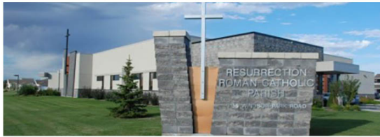
Livestreamed Masses from Resurrection Parish

Masses will be livestreamed from Resurrection Parish, Regina at 9:00 AM daily - archregina.sk.ca/live