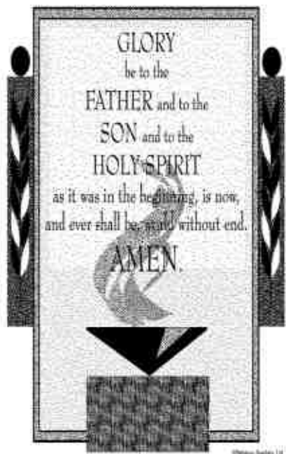
THE MYSTERY of THREE IN ONE