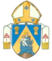
Archdiocese of Regina Coat of Arms

Holy Rosary Cathedral respectfully acknowledges that we are situated on Treaty 4 territory, traditional lands of First Nations and Métis people.