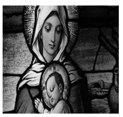
The Solemnity of Mary, The Holy Mother of God