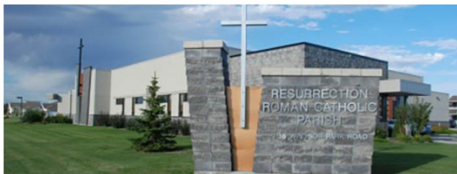
Livestreamed Masses from Resurrection Parish

Weekday and Sunday Masses Masses will be livestreamed from Resurrection Parish, Regina at 9:00 AM daily - archregina.sk.ca/live