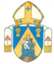
Archdiocese of Regina Coat of Arms

Holy Rosary Cathedral respectfully acknowledges that we are situated on Treaty 4 territory, traditional lands of First Nations and Métis people.